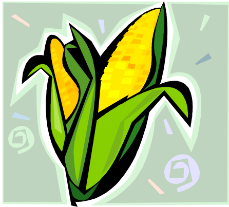
Corn is grown in USA