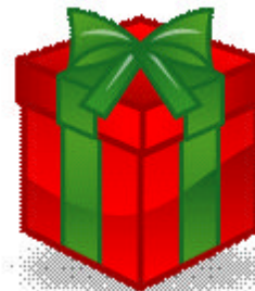
Green Cell Foam is used to protect goods in package