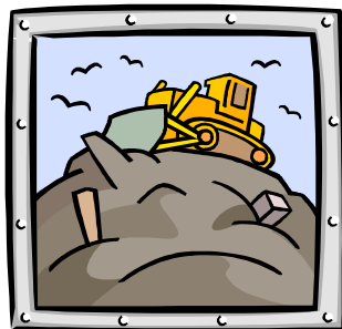
Discarded Green Cell Foam fully biodegrades into the soil