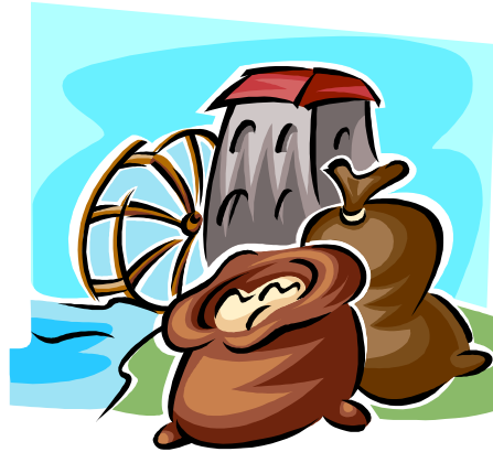
Cornstarch is extracted from milled corn